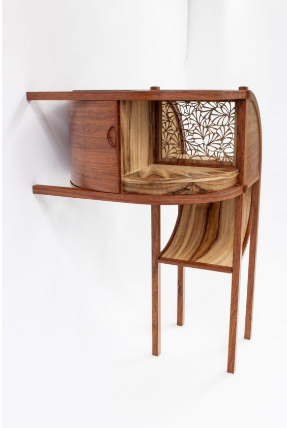
Loose Ends /Miles Gracey