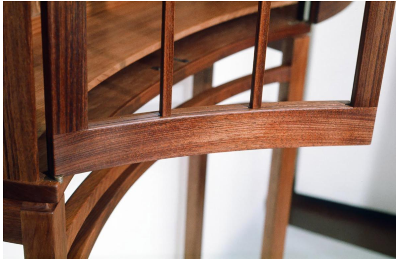
From the Krenov Archives Concave Display Cabinet - James Krenov

ABOUT | HOME | AWARDS & SCHOLARSHIPS | OPPORTUNITIES-FOR-GIVING