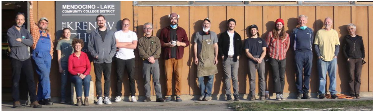
Krenov School Class of 2022