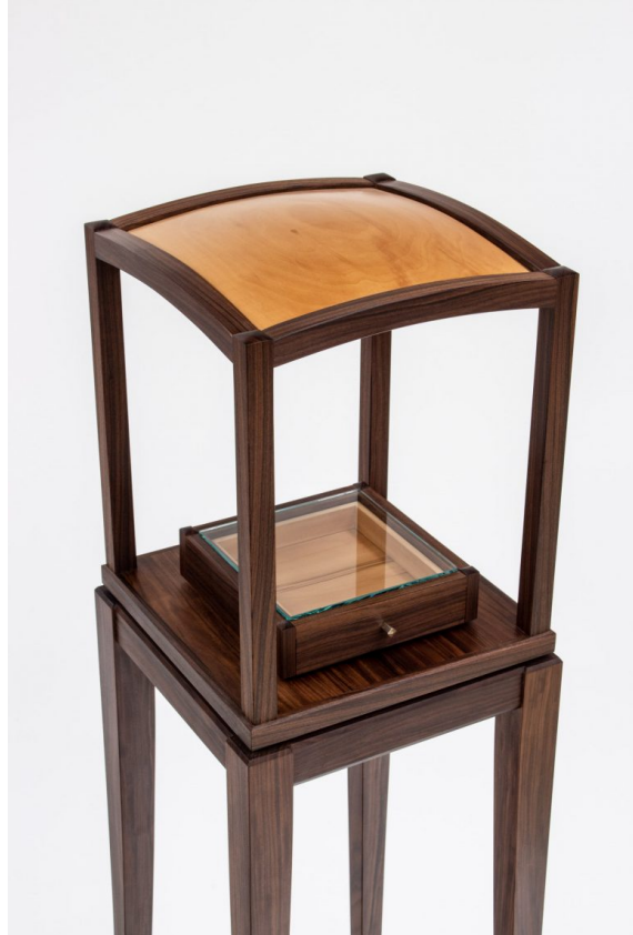
Requiem /Hayden Castagno