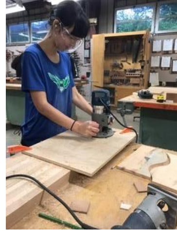
Mendocino High School Wood Shop Students at work in the shop