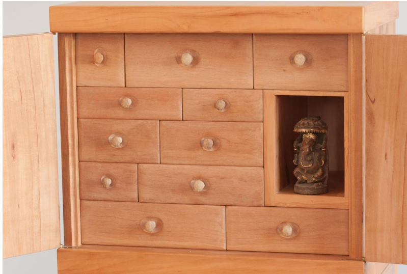
Pear Wood Drawer Cabinet - James Krenov

ABOUT | HOME | AWARDS & SCHOLARSHIPS | OPPORTUNITIES-FOR-GIVING