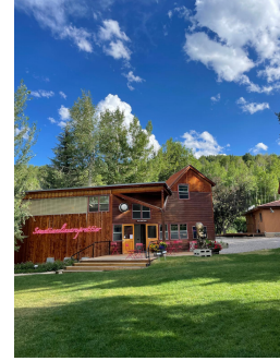
Anderson Ranch Arts Center

I had the pleasure of learning all of these new skills alongside my fellow participants — deeply skilled artists and furniture makers from other craft-based schools. Steam bending was a great team activity and opportunity to get to know everyone. One of the best parts of the week was having the ability to meet and interact with these other artists at the Ranch. Getting to explore the other studios and learn about the traditional Korean onggi being thrown in the ceramic workshop next door or about utilizing mica in book binding really energized me as an artist and was very inspirational. I left the week inspired to create and incorporate the skills I learned in my second year here at Krenov. Anderson Ranch Art Center is a magical place and I feel humbled to have had the opportunity to expand my own woodworking practice. None of this would have been possible without the support of the Krenov Foundation, to whom I am tremendously grateful for all of the support.