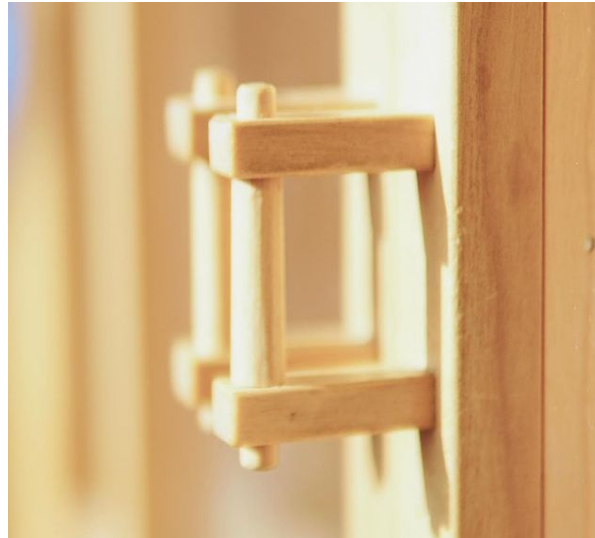
Pagoda Cabinet -James Krenov

ABOUT | HOME | AWARDS & SCHOLARSHIPS | OPPORTUNITIES-FOR-GIVING