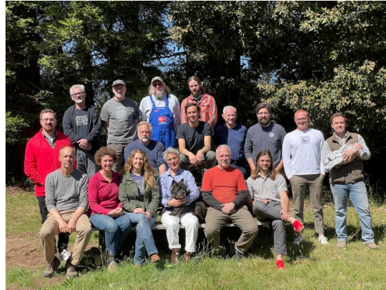
Class of 2022

We look forward to welcoming a group to the Summer classes in June and July, and the next nine-month cohort in August.