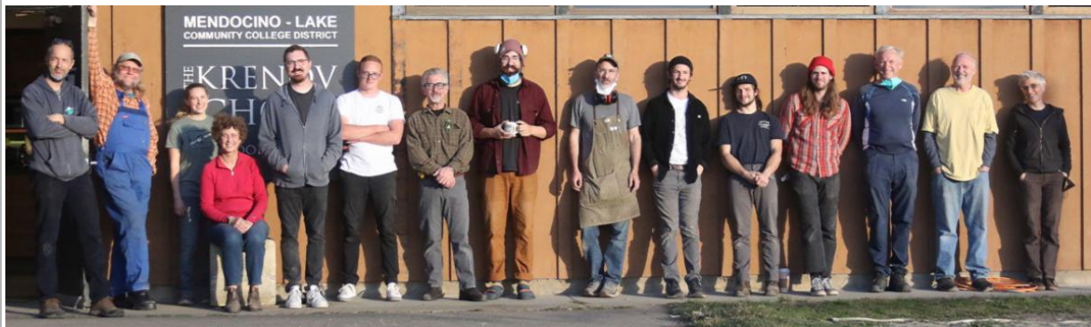
Krenov School Class of 2022