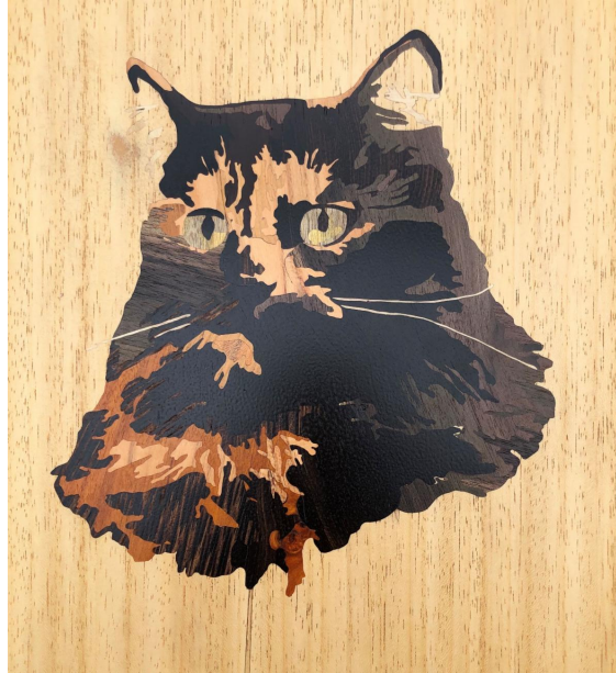
"Frida" by Hayden Castagno