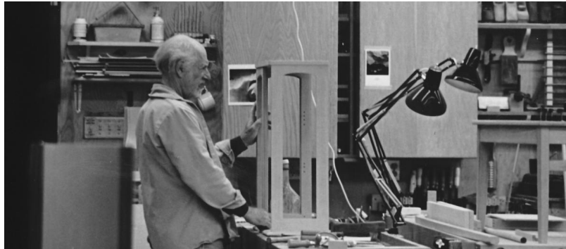
Bird-Foot Showcase - James Krenov

ABOUT | HOME | AWARDS & SCHOLARSHIPS | OPPORTUNITIES-FOR-GIVING