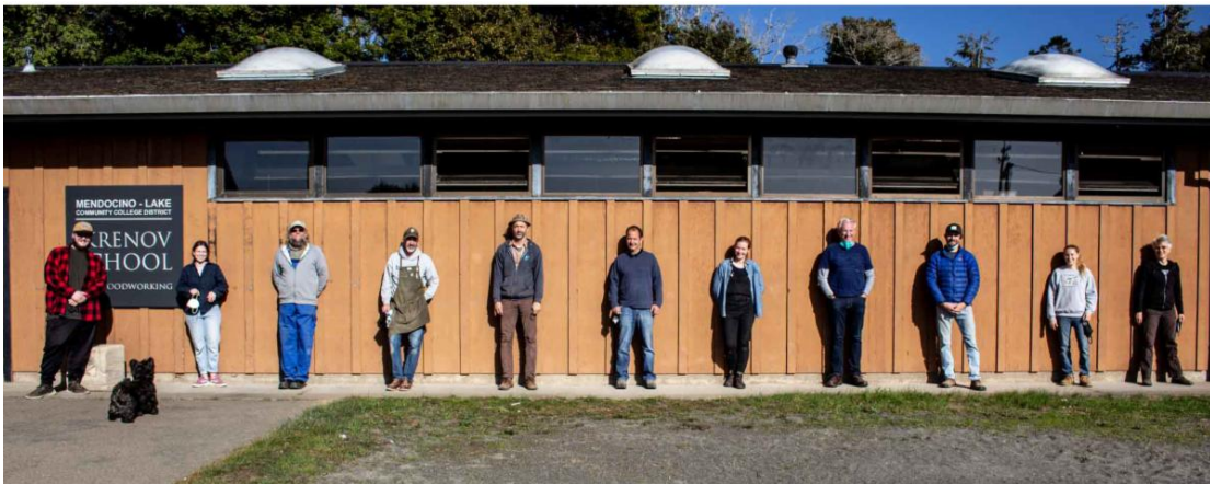
The class of 2021