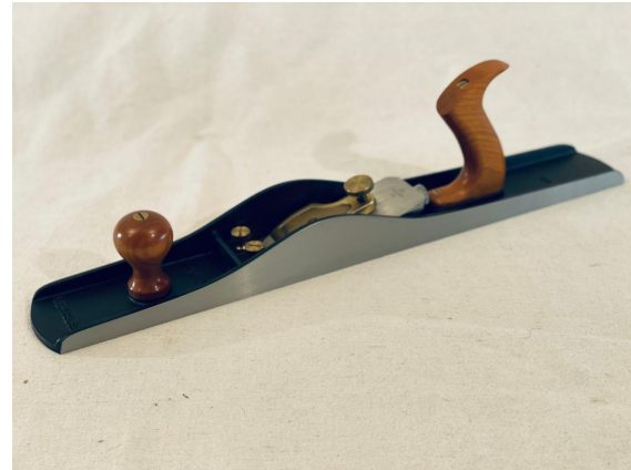
Unusual Lie-Nielsen 7 1/2 low angle jointer plane