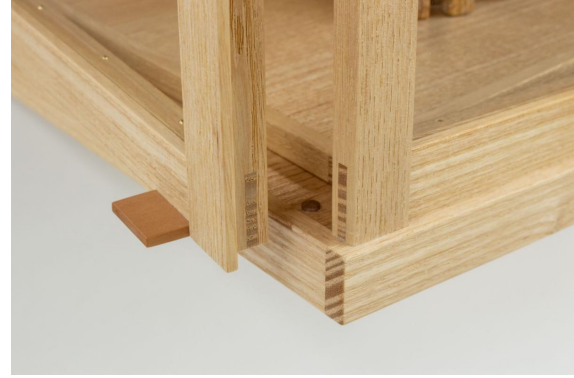
Door Details