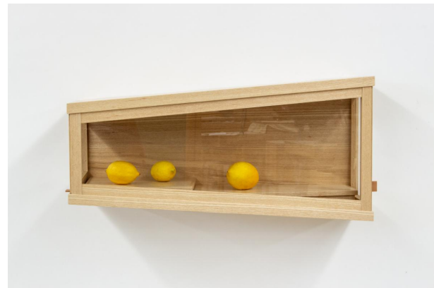
Title of piece: Reflections Materials: Ash, pear pulls, shellac finish Dimensions: 24" x 10" x 11.5"

After her second year at The Krenov School was curtailed by Covid, she was lucky enough to return this Spring to finish her studies. For her final project, she designed a little wall