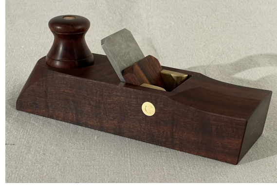
HNT Gordon block plane in Gidgee wood