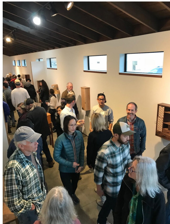
The crowds came out for the reception party on Friday February 7th.

The Krenov Foundation Depends on Your Support!