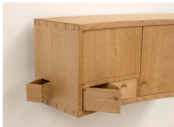
Curved wall cabinet in chestnut by Jan Hasler.