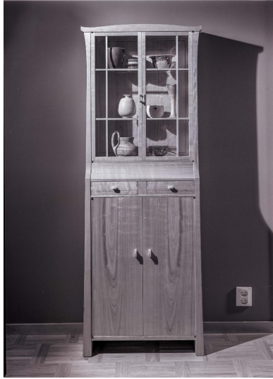
Pagoda Cabinet -James Krenov

ABOUT | HOME | AWARDS & SCHOLARSHIPS | OPPORTUNITIES-FOR-GIVING