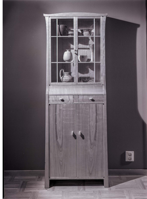
From the Krenov Archives Pagoda Cabinet -James Krenov